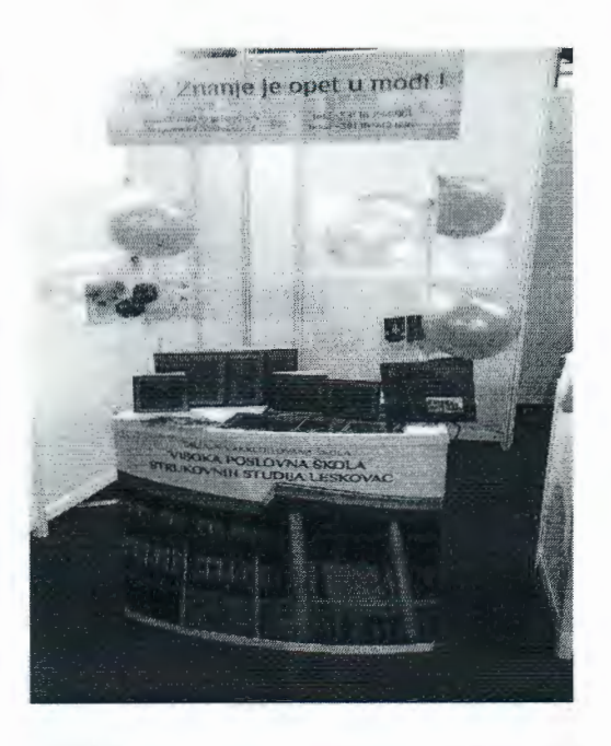
HBSL promotion at tourism fair in Niš