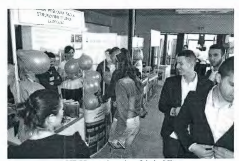
HBSL at education fair in Niš